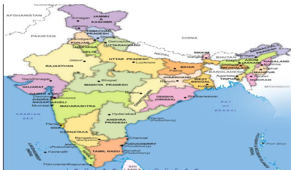
FIG. 1. INDIA MAP