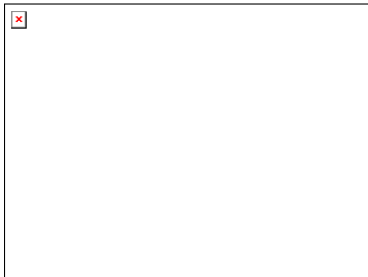
Figure 2: The types of cloud security threats

The value of the organization's cloud-based data may be different for different people. the cyber threat stars impersonating as legitimate providers, users or designers are allow to go through, tweak and delete data; spy on data transit; concern control aircraft because well as management features or launch harmful software program which shows up to be genuine. Therefore, if the business does not have in controlling the authentication and identity in an appropriate method it can be itself accountable for data breaches. Businesses need to correctly set aside gain access to data as per every user's work part and consequently, they require to struggle a great deal with identification administration.