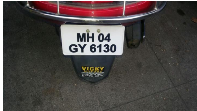
(a) Input image

Manual toll gates require the vehicle to stop and the driver to pay the appropriate tariff. In an automatic system the vehicle would no longer need to stop. As it passes the toll gate, it would be automatically classified in order to calculate the correct tariff.