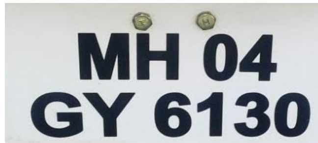
(b) Cropped image