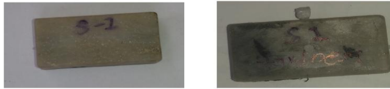
(A) (B) Figure 2 Sample S1 (A) Before Hardness Test And (B) After Hardness Test