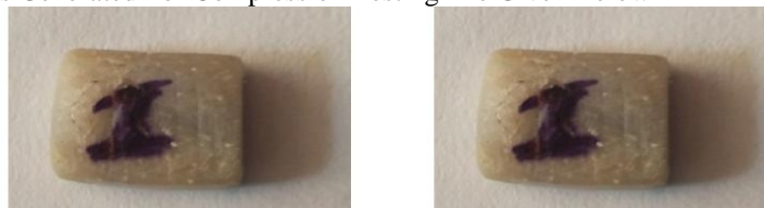
(A) (B) Figure 1 Sample S1 (A) Before Wear Test And (B) After Wear Test

The Test Specimen Is Prepared As Per ASTM D-G99. The Testing Is Done Using Pin-On-Disk Wear Tester [9]. The Results Generated For Compression Testing Are Given Below-