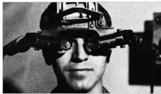
[그림 2] 이반 서덜랜드가 1965년에 개발한 최초의 AR 기기 'The Beard of Damocles'

Well In 1961, A Company Decide To Attach A Headset Called Headsight. A Company Named Phico Cooperation Made A Project To Produce Visualization With Simulation Together With A Tracking System., Which Was Also Used By Military Purposes. For Example, Pilots Can Use VR For Their Training Purpose To Flight In Extreme Darkness And In Extreme Tough Situation Without Putting Themselves In Actual. In 1965, A Person Named Ivan Sutherland Tried To Copy The Real World With The Help Of This Invention , By Naming It Ultimate Display . This Invention Was Like A World In Itself. According To His Vision, This Invention Focus More On 3D Objects .