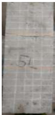
Fig. 2. Crack formation

T.M.Alhajri [2] explained about beams were mainly used due to their stiffness, shear connection due to thickness. Nine specimens were tested, with the ferrocement slabs, by means of a bolted type shear connector. Ferro-cement is a form of thin reinforced concrete structure in which a brittle cement-sand mortar matrix is reinforced with compactly spaced multiple layers of thin wire mesh. A number of wire mesh variations used in ferrocement slab and thickness of the section, the results showed that increasing the number of wire mesh layers as well as the thickness of slab increased the ultimate load carrying capacity. Slabs with 2, 4, 6 wire mesh layers were used for high flexural strength and load carrying capacity. It also reduced the formation of cracks. Slabs with mesh layers perform four shear transfer mechanisms, namely surface bond, pre-fabricated bent-up tabs, pre-drilled holes, and self-drilling screws. In Universal Testing Machine test has been done and resulted. Stress strain relationship has been found by placing strain gauge at the bottom of slab panel tested. Z. Abdollahnejada [20] stated that Stiffness of the slab increases due to the thickness of the panel whereas there is corresponding decrease in deflection as compared to conventional concrete. Wire mesh also cut and all were tested to determine the yield and ultimate tensile strength. They concluded that the specimens developed primary cracks.