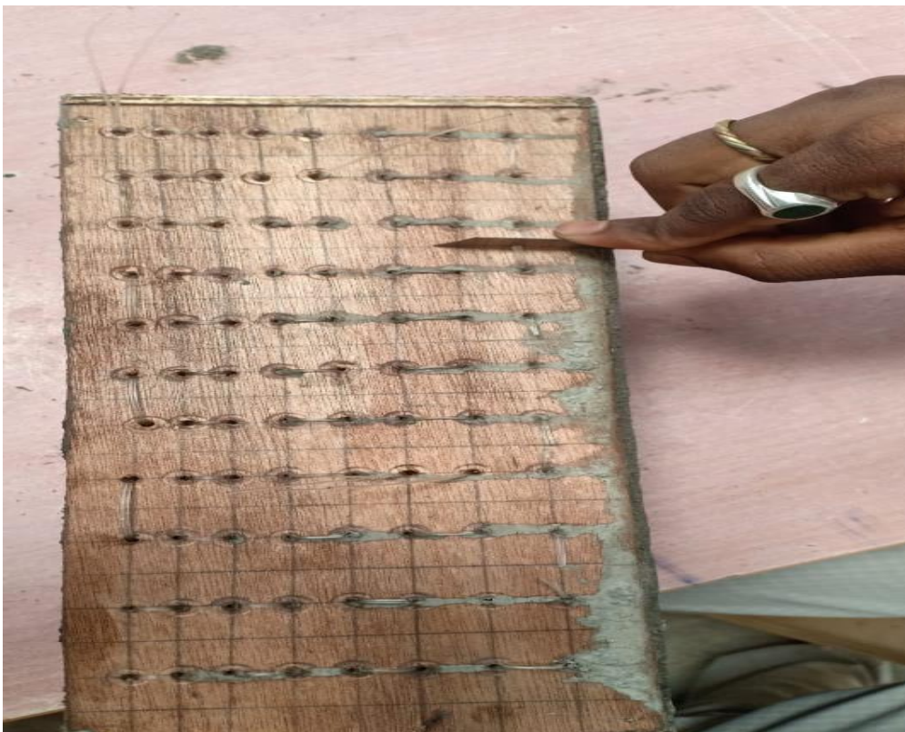
Inserting of optical Fibres into Prototype Model followed by Casting and Furnishing the Specimen