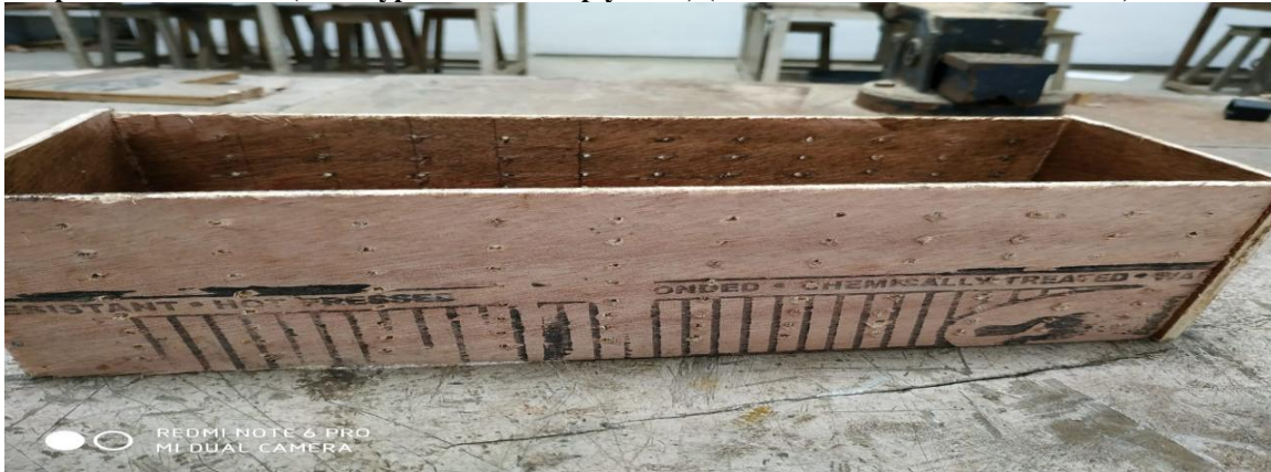
Preparation of Prototype model