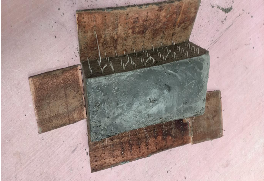
DeMoulding of Prototype Model