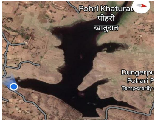
Fig – 3 Study sites.

Materials and Methods - The study area of Bilpan Pond (Fig 1 and Fig 2) is in Jhonthri Tahsil of Dungarpur District, Rajasthan, India. The pond is located at a latitude of 230 35'10 and a longitude of 730 44'20'. The catchment area of this pond is 17.61 sq. km. It is its catchment area also. The total yield available from this pond is 142.05 Mcft, while the gross capacity of this pond is 96.40 Mcft and the live storage capacity is 94.40 Mcft. The maximum height of this pond is 53.63 Ft, and the whole tank level is 435.50. This pond is earthen. It is helpful in irrigation and domestic use. The Gross command area of this pond is 620.00 Acres. The water samples were collected monthly from all four stations during the year 2020-2021 respectively and analyzed by the standard method of (APHA, 2005). In the present investigation following physico-chemical parameters were analyzed.