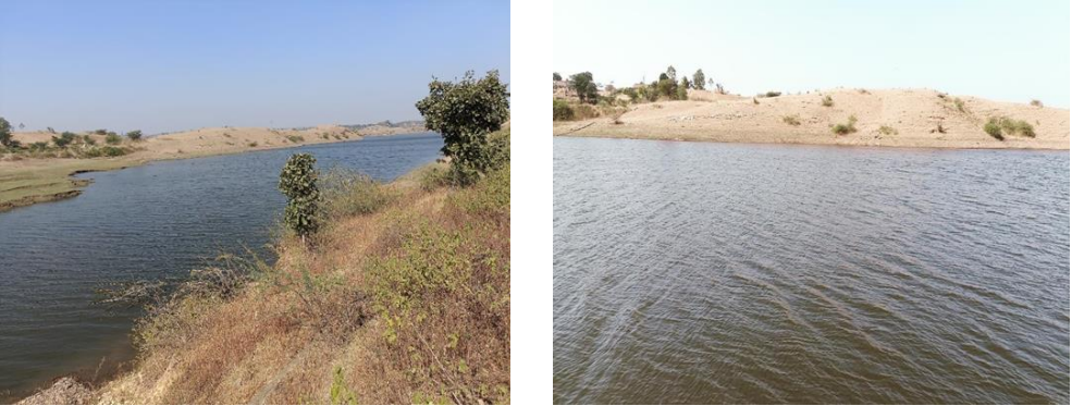
Fig-1 Sampling station 1 Bilpan Pond

Length-Weight Relationship Of 9 Fish Species In Amarpura Dam, Samliya Dungarpur, (Rajasthan).