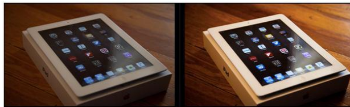
Figure 1 :Color illumination