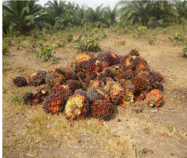
Figure 1: Harvested palm fruit bunches at Gilgal farms