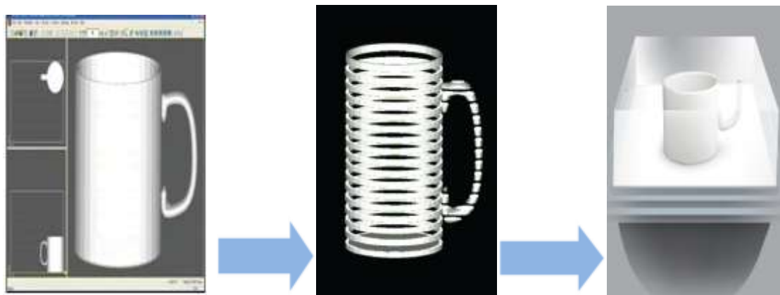
Fig:2 Layered Manufacturing: Concept-Model-Slicing-3D Printing

Slowly the quality of the prototypes is improving and proved to have a functional quality. This is why nowadays, for small series, layer manufacturing technologies are used to produce actual end production parts. Production of end parts with a layer manufacturing technology is known as Rapid Manufacturing (RM).