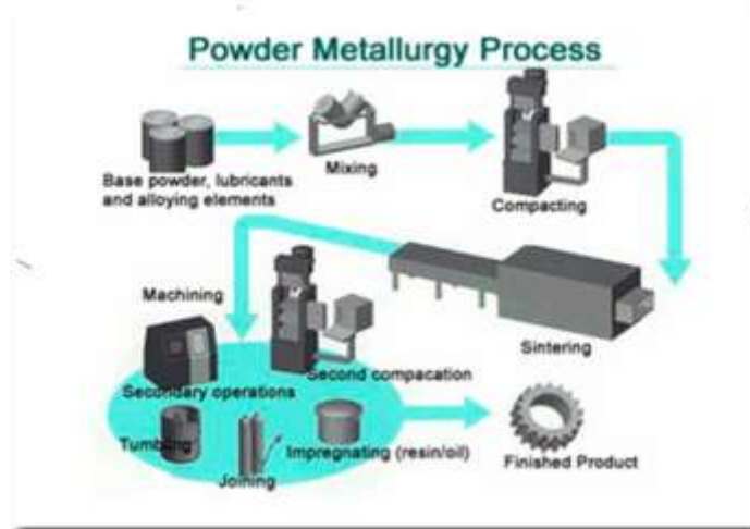
Fig:3 Powder Metallurgy Process

Gradation processes can again be classified as Constitutive process, Homogenizing process and Segregating process [4]. Various Vapor Deposition Technique such as Sputter deposition, Chemical Vapor Deposition (CVD) & Physical Vapor Deposition (PVD) are used to deposit functionally graded surface coatings to obtain better microstructure, but the limitations are these techniques can only be used for depositing thin surface coating and are energy intensive and produce poisonous gases as their by-product. Other methods such as Plasma Spraying, Electro Deposition, Electrophoretic Deposition (EPD), Ion Beam Assisted Deposition (IBAD) and Self-Propagating High-temperature Synthesis (SHS) are also used to manufacture materials with functionally graded coatings [5, 6].