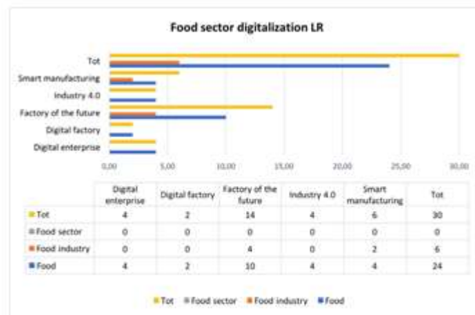
Fig. 1. Food sector digitalization from the literature point of view

As mentioned earlier, first analysis used separately different keywords. In the figure and table below it is possible to see the search results: