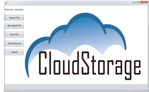
Figure 4.1: - Client Functionalities

Figure 4.1 demonstrate the all available functionality for clients like file uploading, data encryption, data download, and view files.