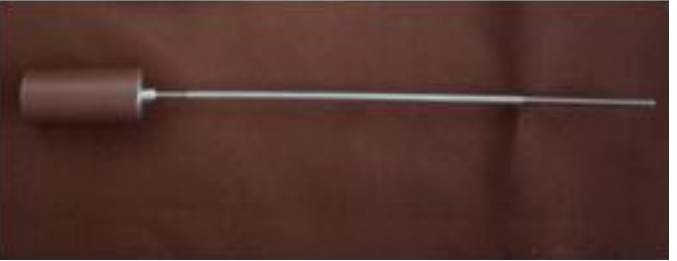
b. Piston and piston rod assembly