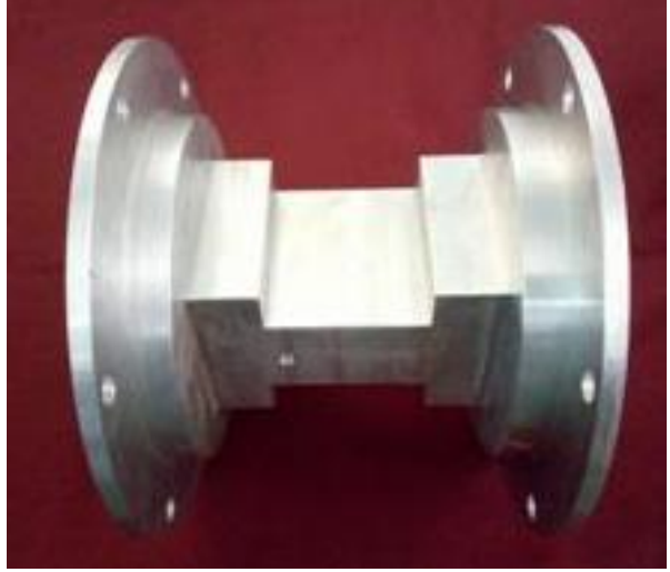
a. Main body