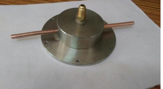
c. Hot end exchanger body Fig. 4 Different parts of newly fabricated cold head.