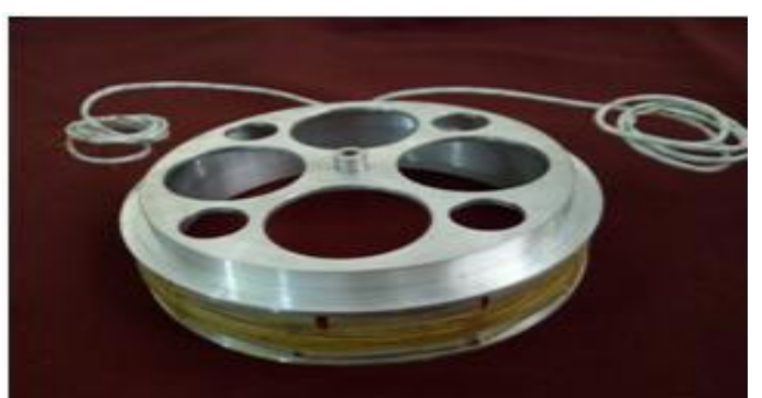
c. Coil former Fig. 3 Different parts of newly fabricated compressor