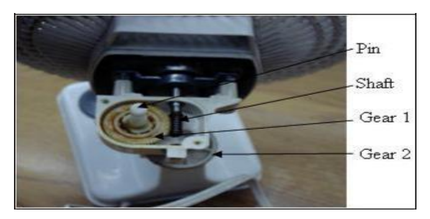
Fig. 2: Oscillating Mechanism of Standing Fan

A standing fan with oscillating mechanism includes a clutch member for adjusting the angle of oscillation according to user's need. When the motor is actuated, the rotating torque induced by the motor and the transmission mechanism is smaller than the rotational resistance of the clutch member such that the motor may drive the fan to oscillate. Further, when the user applies an external rotational force greater than the rotational resistance of the clutch member such that the motor may other members except the fan and the fan suspension tube. In this manner, undesired damage of the mechanism or motor due to inappropriately applied external force can be avoided efficiently.