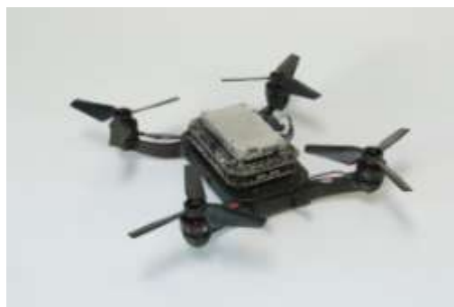
Fig: Drone detector