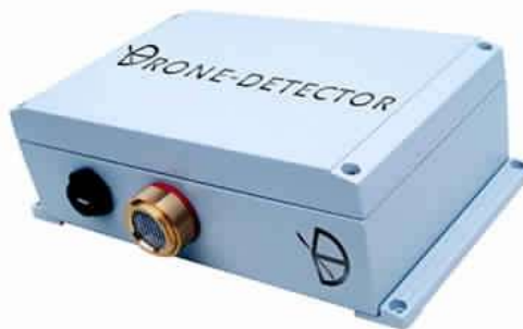
Fig: Orelia-drone detector