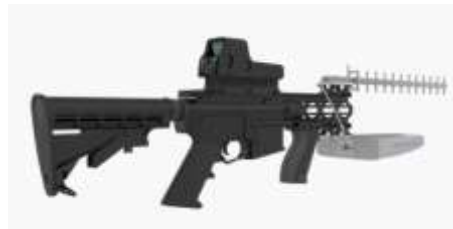
Fig: Drone shield