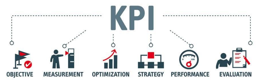
Figure 2. Management Indicators

According to this study, the author performs an analysis of the theory of indicators in which he takes as an example a company, explaining that this internal process must be based on administrative systems and measurement of strategies and capacities. Metrics should not only be used just as tools, but their general purposes should be to define the organizational strategy. [10]