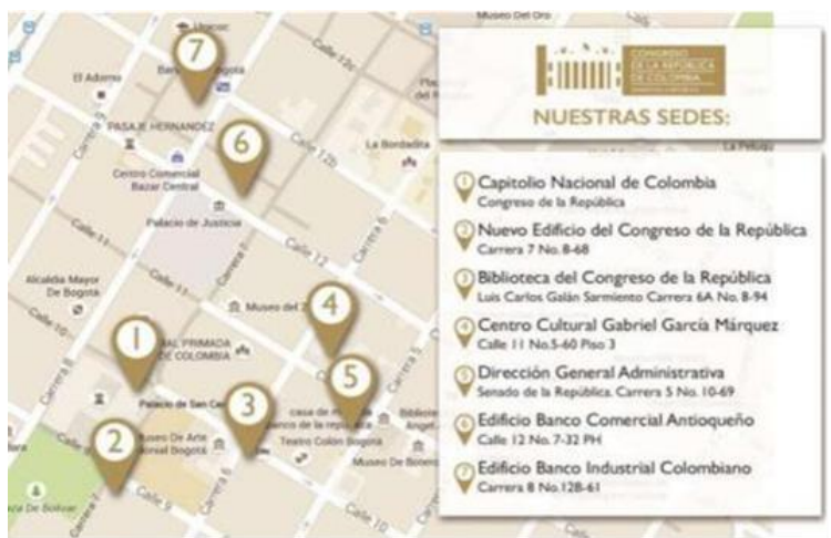
Figure 3. Evidence from the seven seats of the Senate

The city of Bogotá is located in Colombia's central area of the country. The study area is in the locality of Candelaria. In figure 3 the 7 seats of the Senate that are part of the study: