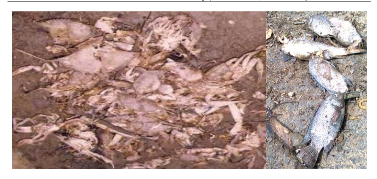
Plate 4: Death of fishes and craps due to hydrocarbon contamination of rivers