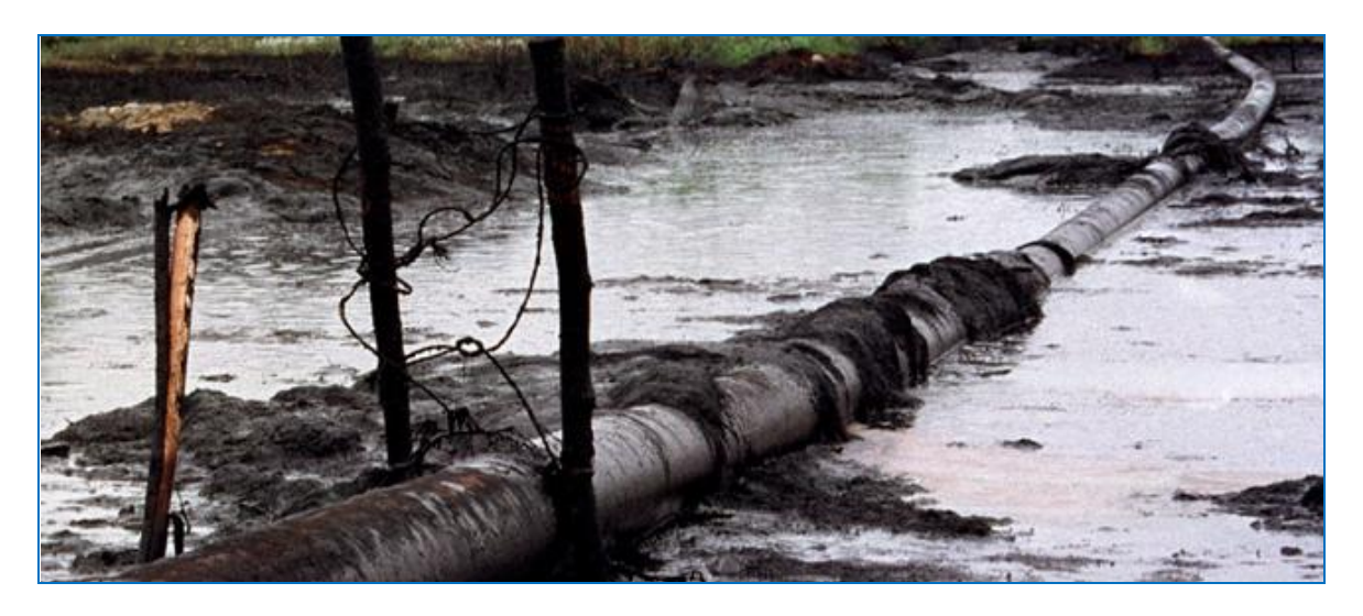
Plate 1: Land degradation due to leakage from crude oil pipeline in the area