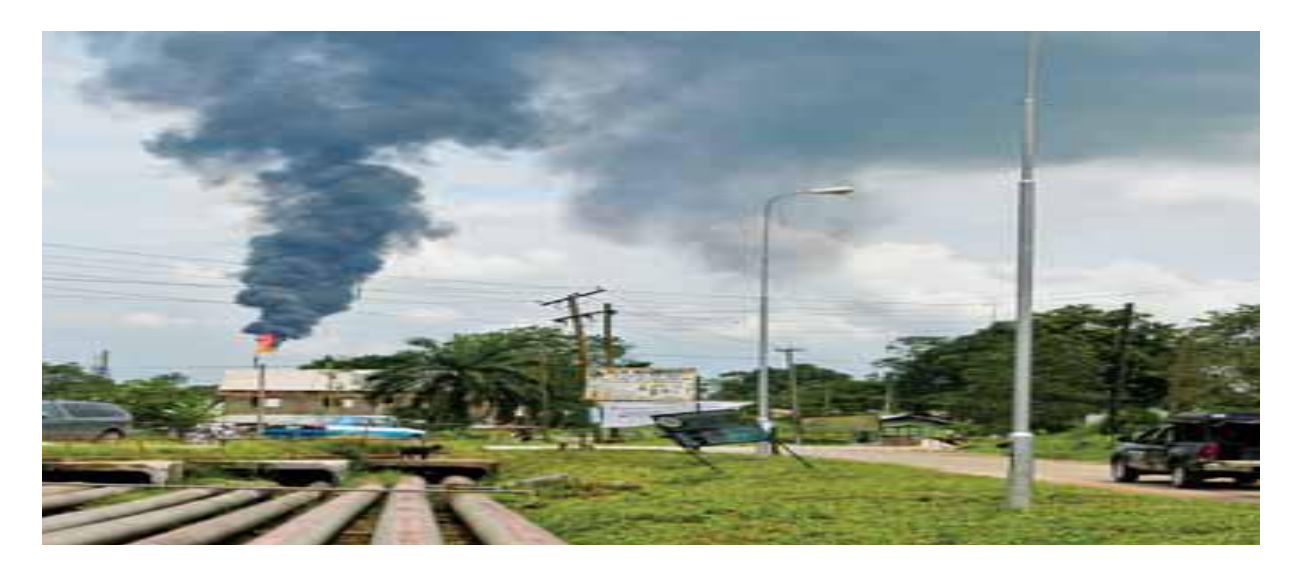
Plate 5: Gas flaring at one of the stations in Southern Nigeria