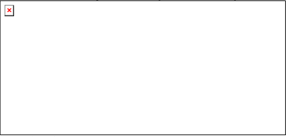
Figure 4 : Number of ransomware attack per minute

Bias, unfairness and discrimination are permanent challenges in machine learning models.