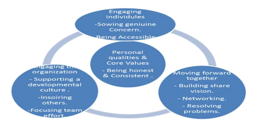
Fig.3 Different types for the followers who follow leader

A good leader is that who is selfless and determined to achieve goals and visions of his followers. A leader should be goal oriented and motivating. I strongly agree that every leader needs to be the perfect one between the team in future [27]. This is important as some followers might lose vision of the dream along the way and the leader is tasked with reviving that dream through motivation. What the theory told us that there are many sways to focus on your task and do the best, so I agree with that [28]. There is a social event that leaders can get more benefit from it and learn all the characteristics for that [29]. Another characteristic of a good leader is that he should be moderate and humble. Humility is important as it will help the leader to deal with difficult situations that might arise without showing signs of pride. I don't agree about what author said for getting just information without having any experience for how the leader act and manage [30]. I agree that there are many ways to be a successfully leader in any place [31]. There is many leaders who investigate their time with many organizations and companies to work as a part time and I agree that everyone look for money [32].