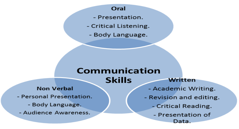
Fig.4 Communication Skills

Communication is an essential factor in leadership. Without an effective means of communication, the leader, and his followers are sure to misunderstand each other and this will affect their relationship. A good leader should ensure that he or she keeps a good communication flow with the followers [33]. Ignorance of doing this will result in the followers considering the leader as selfish and self-centered and will not eventually work with him or her. I agree that there are many different communication style for leadership and characteristics to achieve the goal because this is what the leaders need in the end [34]. I strongly agree that there is a language in leader's life so he has to get it clearly [35]. There are different reputations for employee who always face different view from the leader at work [36]. There are no specific models for leaders who communicate with others so I agree with it [35]. I agree that the leader's message can be delivered as what he says for teamwork [37]. The way which leader use to communicate with other is a technology so it's easy to get the work done [38].