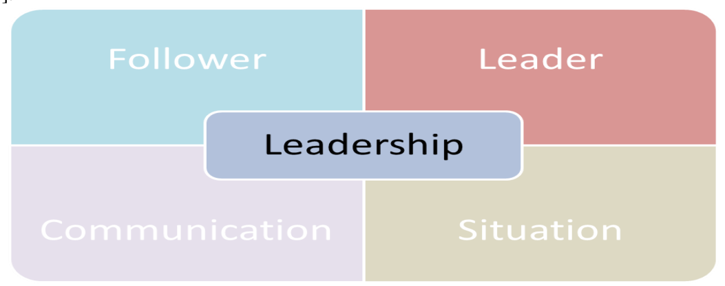
Fig.1 Leadership Factors and how they complete each other

It is imperative to understand that leadership is a skill that is used in weaving together all aspects that are meant to bring about progress and direction in handling important matters. On this perspective, it is then in order to say that without people leadership does not exist[14]. What this means is that the skills which are in this case, leadership skills do not exist if the person who will put them to use is not there. In simple language, the person is the independent variable while leadership is the dependent variable[15]. Leadership is very important so I agree that we have to handle the problems that we face between management and leadership [16]. There are many kinds of leadership that depends on the situation you will face in every team [17]. All researcher are agree that the leadership has different characteristics which the leader have to read and study all of them [18]. Sometimes the leadership compares between different theories between many leaders and I agree with it [11]. I agree that leadership has to practice for learning a lot about different people and worker that leader will face [19]. The leader has many effective and successful for long time which I'm agree with that [20].