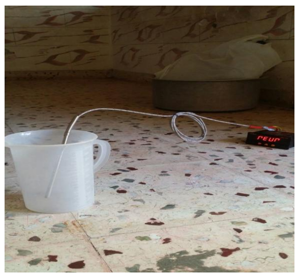
Fig 1 Thermocouple with measuring Flask

The solar radiation passes through the glass in front of the absorber plate and strikes the flat black surface of the absorber plate where the solar energy is absorbed as heat (i.e., by increasing the internal energy). This causes the flat-plate collector to become very hot, and so the water contained in the risers and headers bounded to the plate also absorb the heat by conduction. The water inside the tubes (risers/headers) expands and so becomes less dense than the cold water from the storage cylinder. On the principle of thermosyphon, hot water is pushed through the collector and rises by natural convection to the hot water storage tank and cold water from the cold water tank simultaneously descends to the bottom header of the collector by gravity pull. Therefore, there is circulation as a result of an increase in temperature and volume of the warmer water to the hot water storage tank. The circulation continues as hot water goes out, while cold water comes in. The partly energy absorbed by PCM which store the energy can be utilized as the sun position will vary.