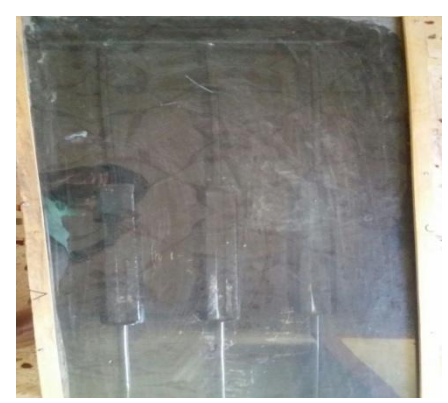
Fig 3 Solar Water Heater with Wax Box