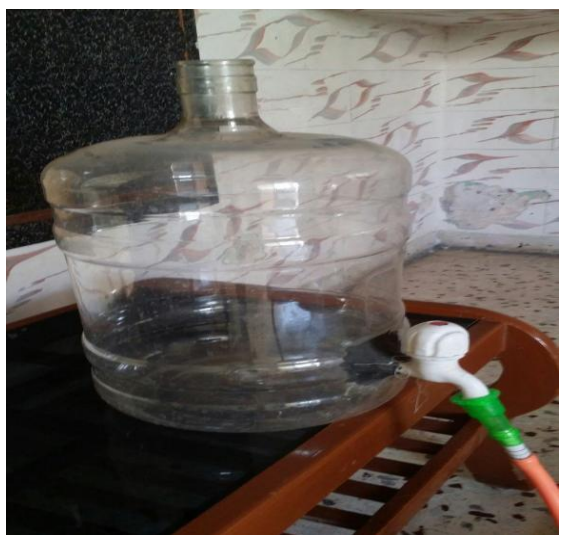
Fig 2 Water Tank