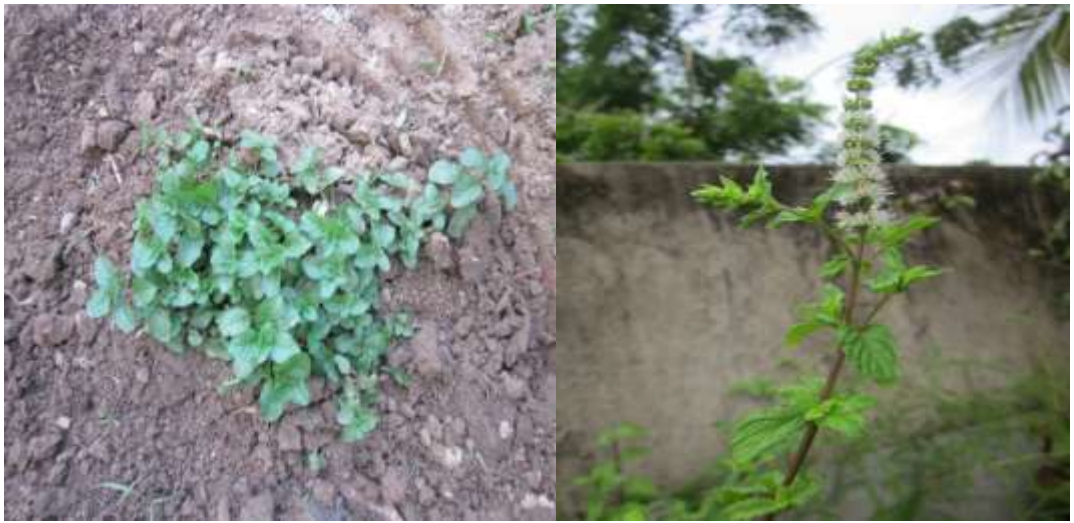
Fig. 19 Mentha piperita L. (In Garden and in Pot with flowers)