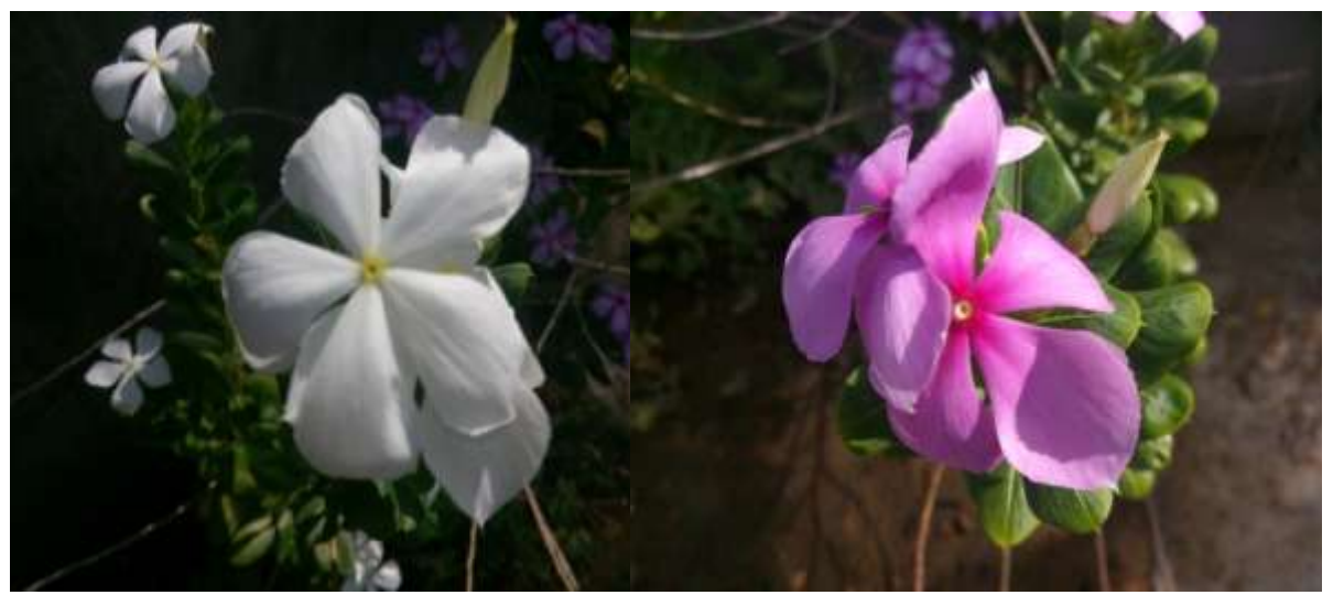
Fig. 7 Catharanthus roseus (L.) G. Don. (White and Pink variety)