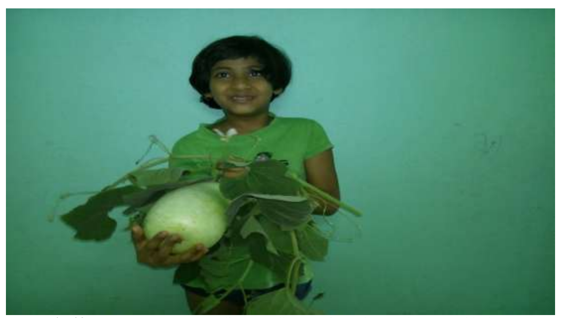
Fig. 29 Lagenaria siceraria (Molina) Standl. (Organic product used as Vegetable drug)