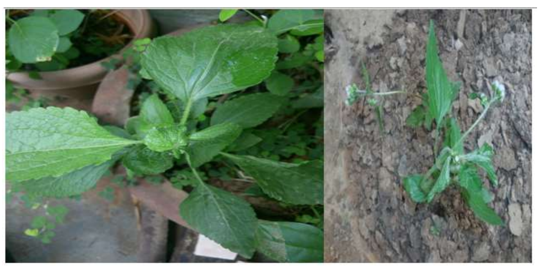
Fig. 3 Ageratum conyzoides L. (Right in Experimental garden)