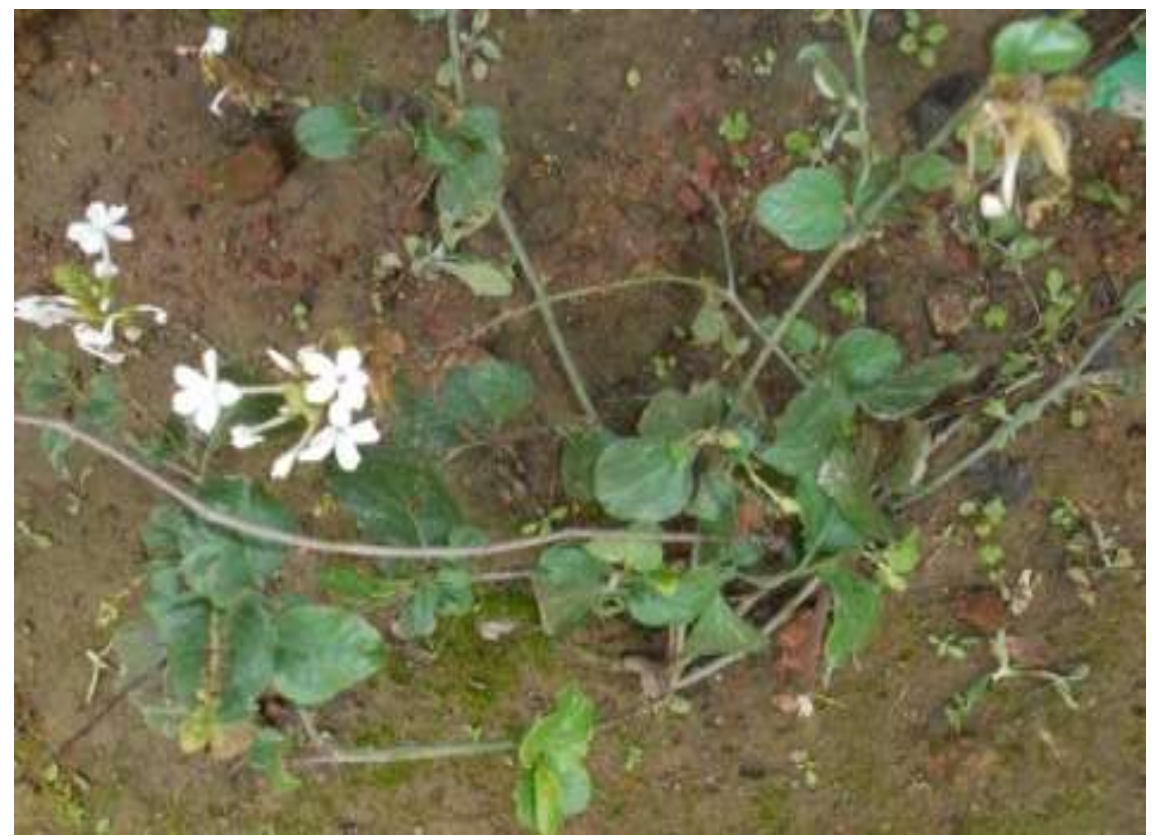
Fig. 23 Plumbago zeylanica L.