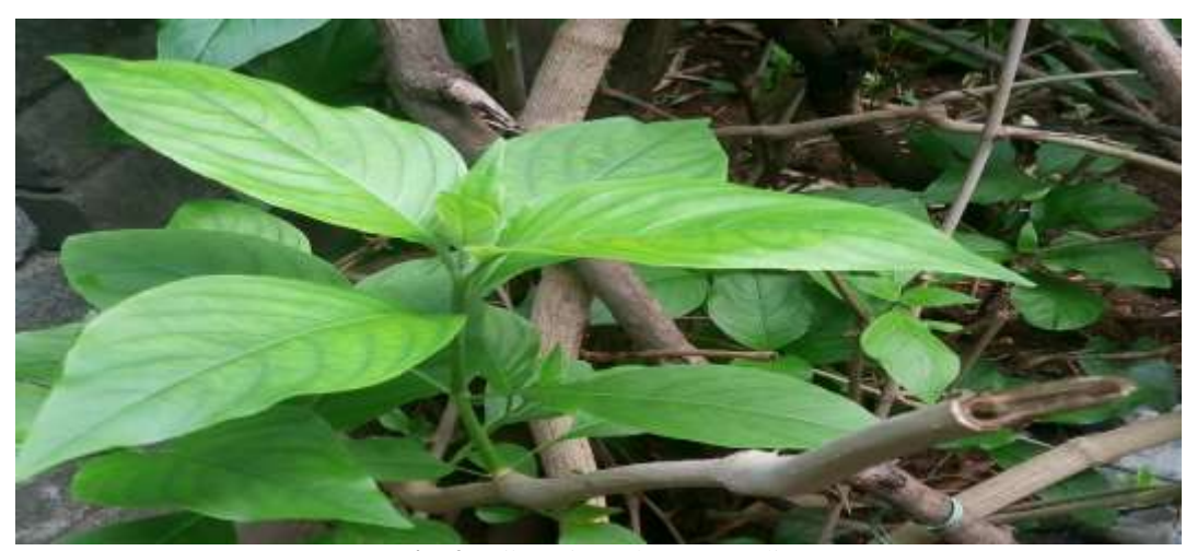
Fig. 2 Adhatoda zeylanica Medic.