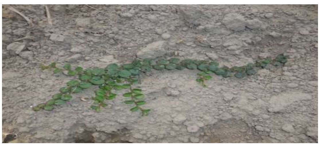
Fig. 15 Evolvulus nummularius L.