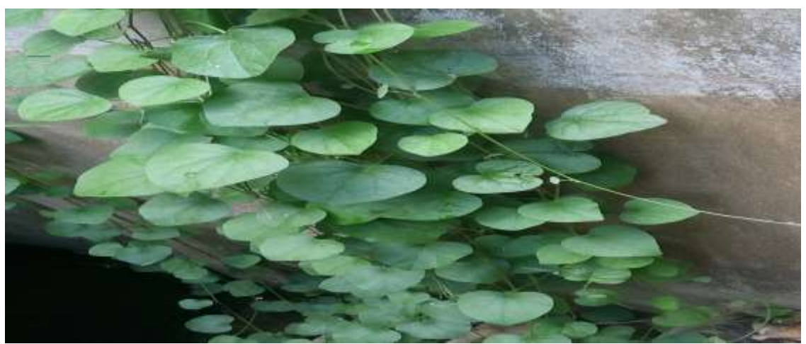
Fig. 25 Stephania japonica (Thunb.) Miers. at Garden