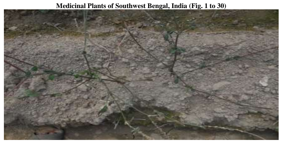
Fig. 1 Achyranthes aspera L.