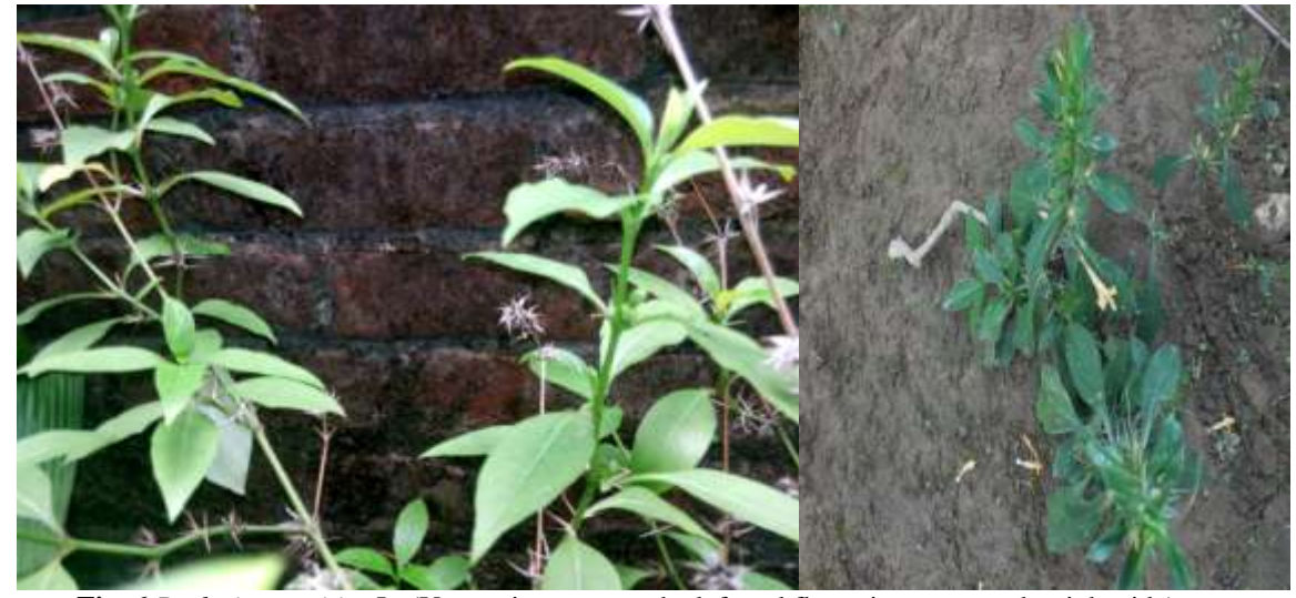
Fig. 6 Barleria pronitis L. (Vegetative stage at the left and flowering stage at the right side)