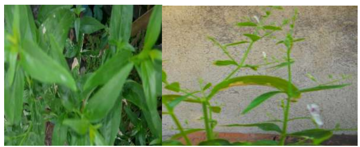
Fig. 4 Andrographis paniculata (Burm. f.) Wall ex Nees (Left Vegetative stage, right reproductive stage)