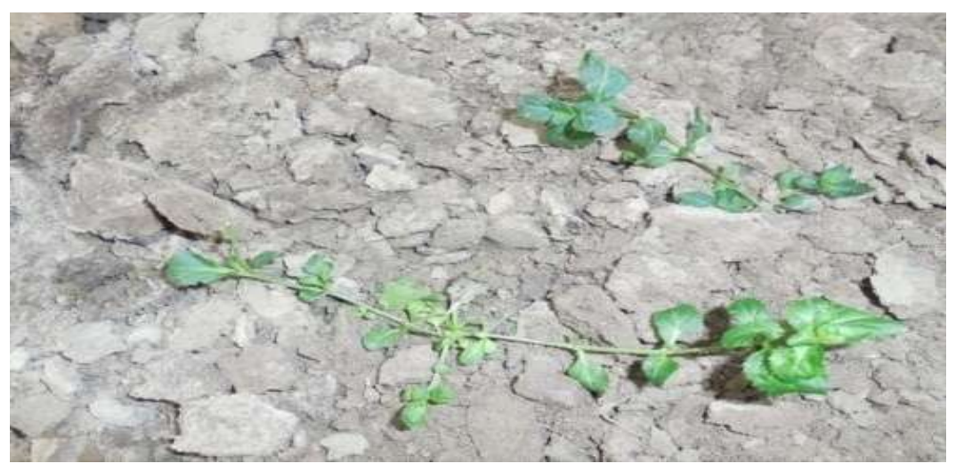
Fig 17. Mecardonia procumbens (Mill.) Swall.