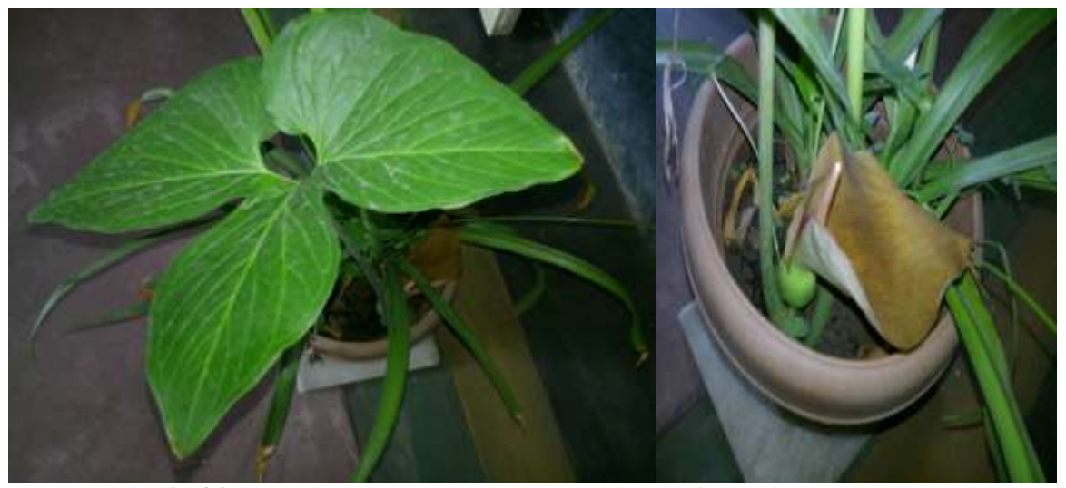
Fig. 26 Typhonium trilobatum (L.) Schott. (Right with flowers in May, 2017)