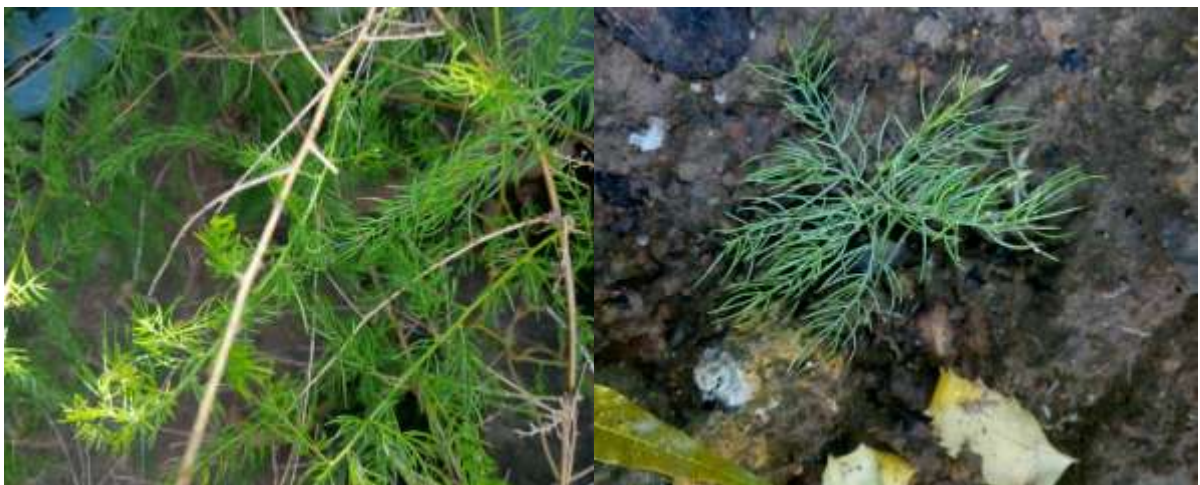
Fig. 5 Asparagus racemosus Willd. at Left, right one seedlings in wild