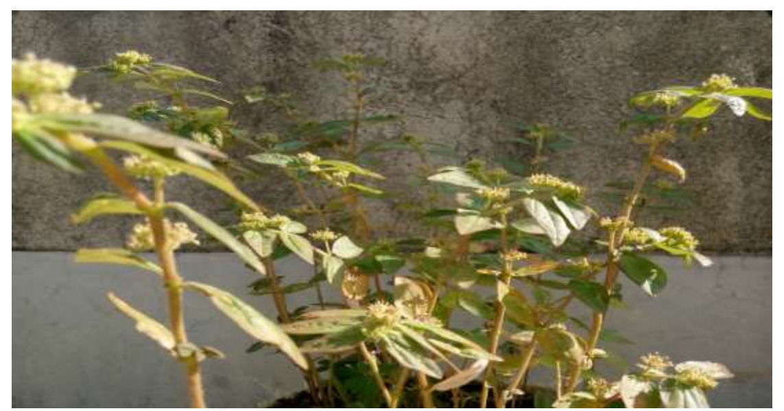
Fig. 14 Euphorbia hirta L. in Pot