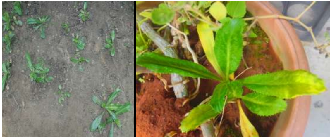
Fig. 12 Eryngium foetidum L. (In Garden, in pot)