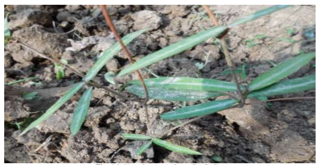
Fig. 16 Hemidesmus indicus (L.) R. Br.