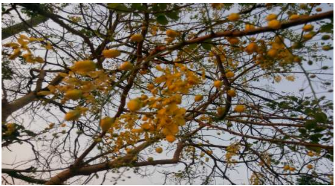
Fig. 30 Cassia fistula L. (Flowering in May, 2017 in wild at Bhimpur, Midnapore)