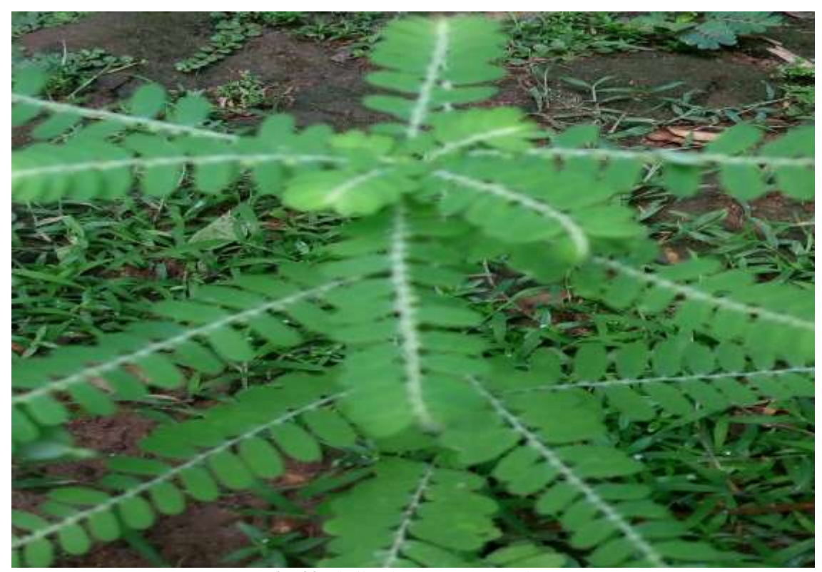
Fig. 22 Phyllanthus fraternus Webster