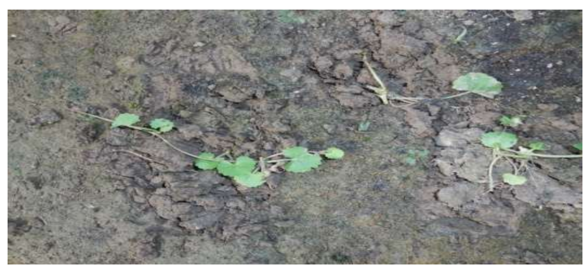
Fig. 8 Centella asiatica (L.) Urban.