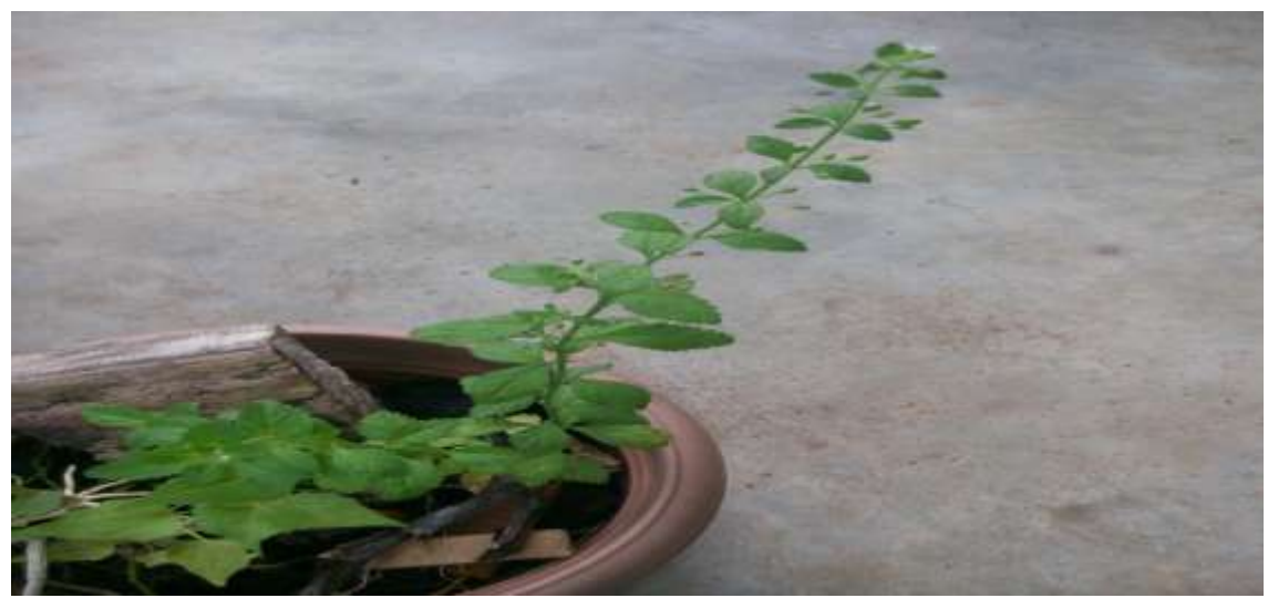
Fig. 24 Mature Scoparia dulcis L.