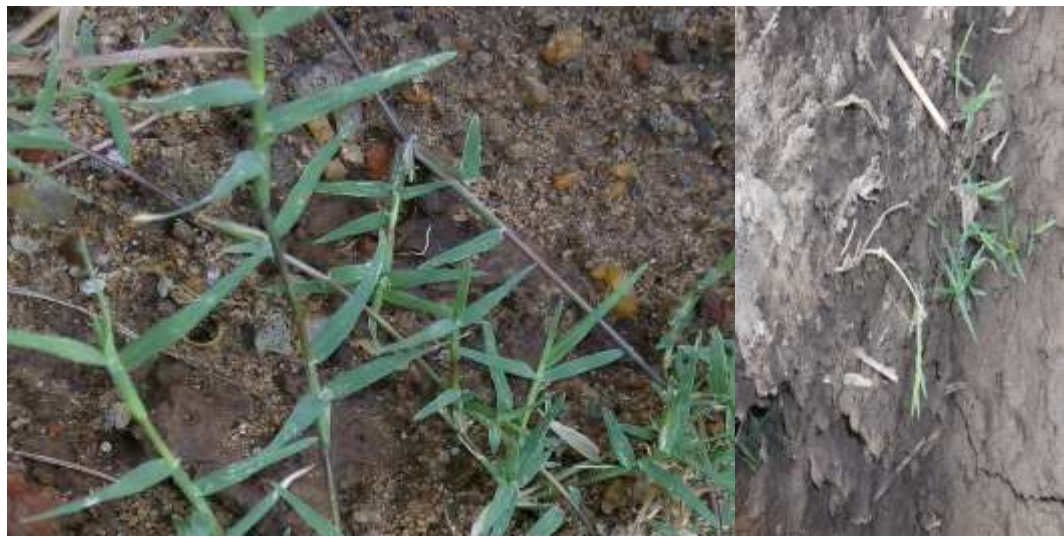
Fig. 9 Cynodon dactylon (L.) Pers. (Left in wild and right in cultivated land)