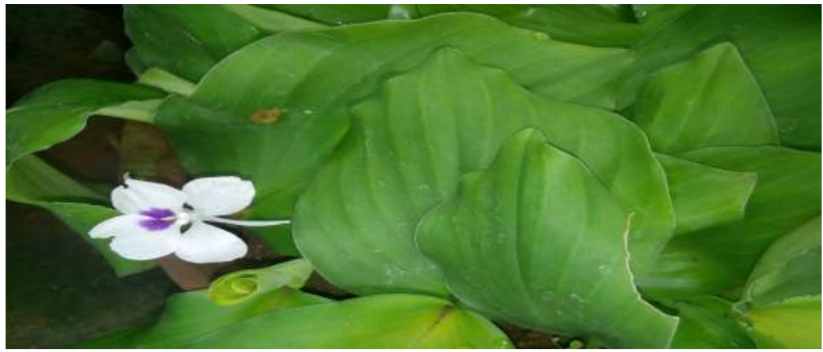
Fig. 27 Kampferia rotundifolia L. (Flowering in May under pot culture)