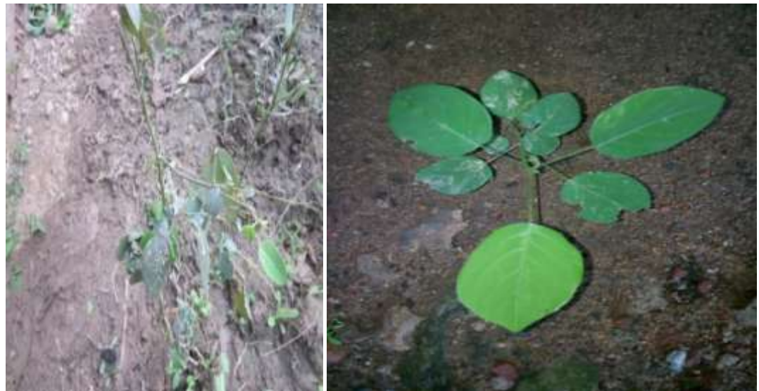
Fig. 11 Desmodium gangeticum DC. in experimental garden (left), Forest floor during monsoon