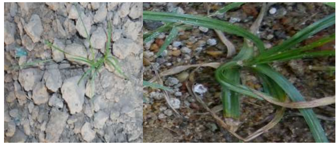
Fig. 10 Cyperus rotundus L. (Agricutural land and in Waste place)