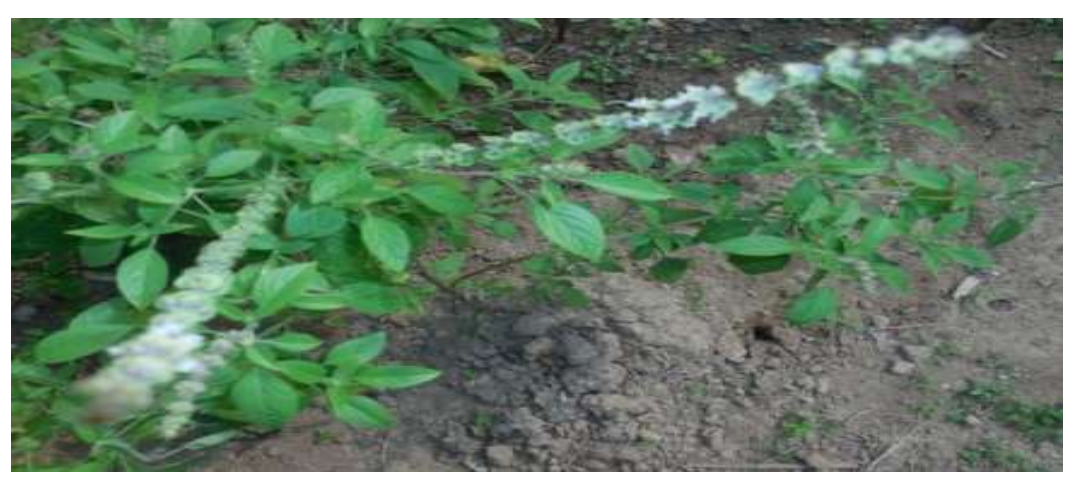
Fig. 20 Ocimum americanum L.