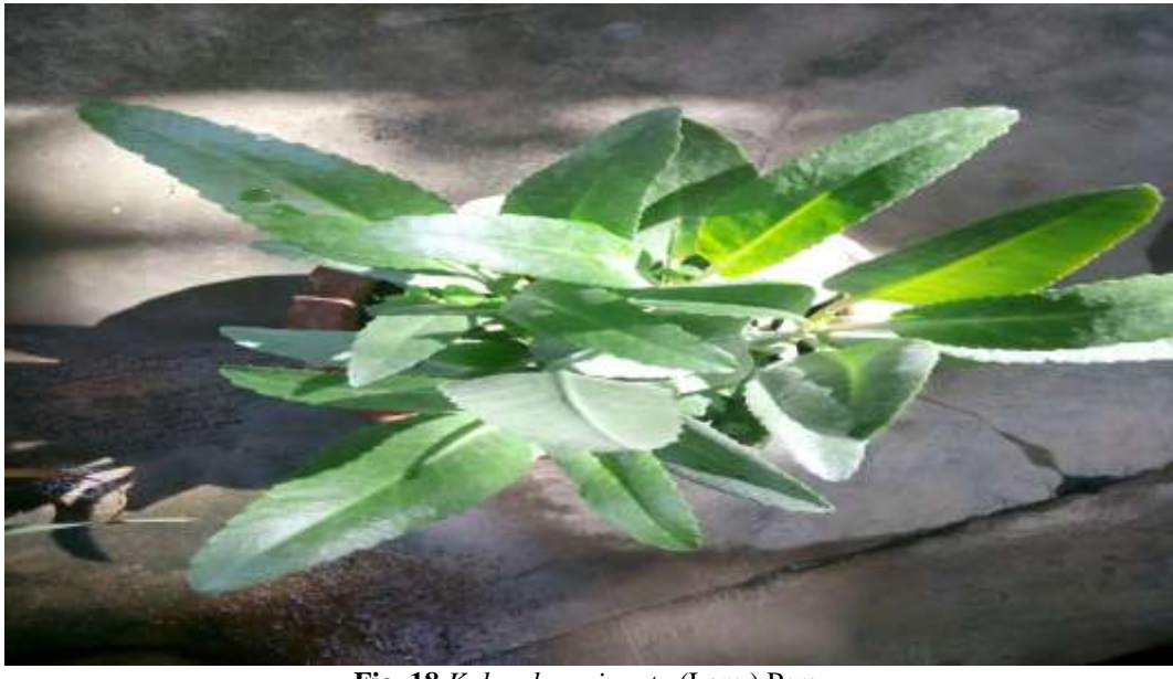
Fig. 18 Kalanchoe pinnata (Lam.) Pers.