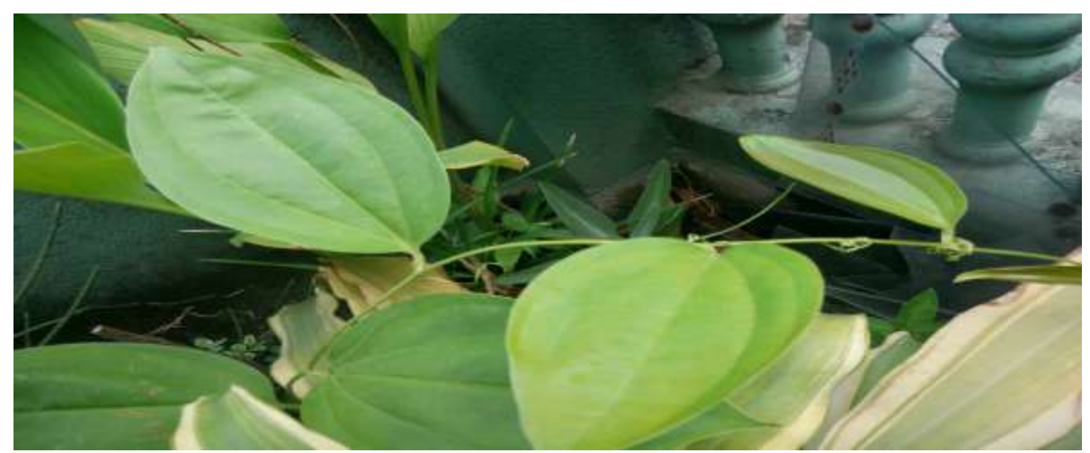
Fig. 28 Smilax macrophylla Willd.