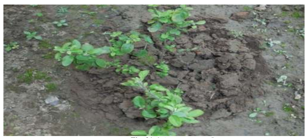
Fig. 21 Ocimum sanctum L.