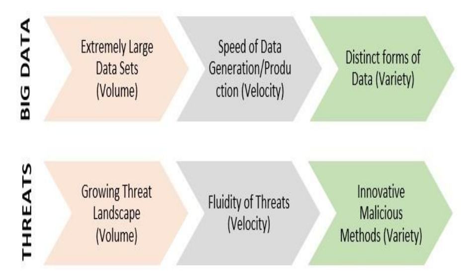
Figure 2. A Simultaneous Growth in Big Data and Threats

Passwords and controlled access via permissions, Two-factor (or multi-factor) authentication, Firewalls, Data Leakage Prevention (DLP) Technology are basic available existing technological approaches that are already relatively mature with time but inadequate to tackle and fulfill demands of big data. Since confidentiality, authentication and integrity are the basic security primitives, for these and other specific needs for big data one integrated solution from a holistic point of view rather than solving the security and privacy issues on requirement basis. Due to gigantic and variety of data the traditional cryptography based security mechanism are not sufficient, to resolve this. Authors [15] suggest a picture data security in hybrid cloud. Since with the cross breed cloud touchy cloud can be put away in private mists while no sensitive information can be store out in the open mists. By bringing the security related data together at single centralized place, analysis can be performed that wasn't possible previously. This provides a competitive advantage over previous approaches here additional data sets can be correlated in different ways with existing data and new relationships will be found which was previously unimaginable.