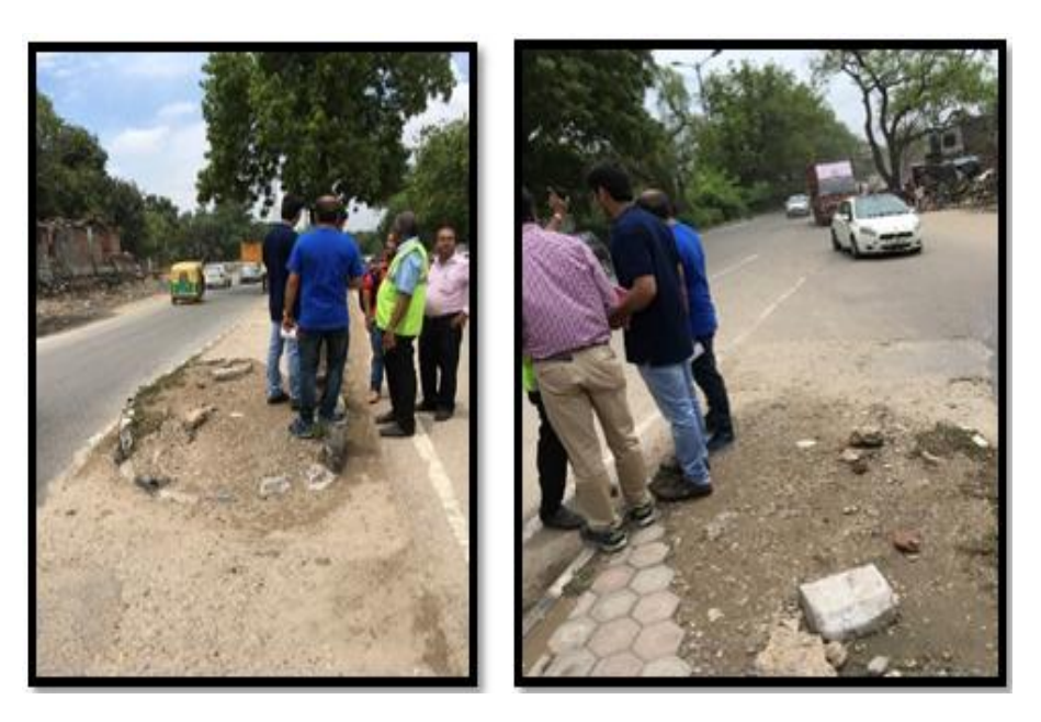
Figure 9median without sign board and no acceleration lane

Pedestrian should not be allowed on the flyovers and the zebra crossing marks need to be removed Priority: Essential