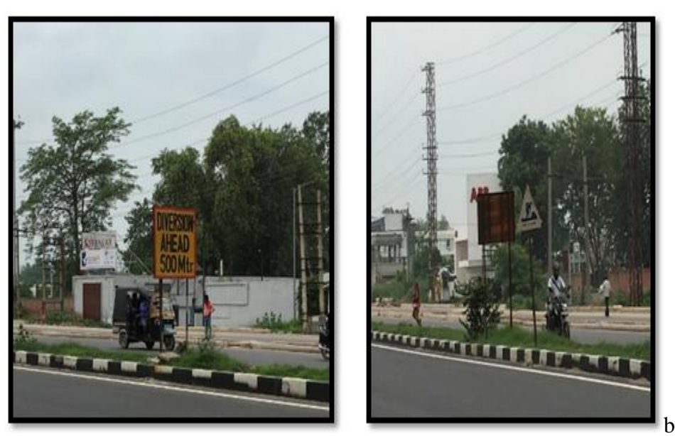
Figure 5 Sign boards without retro-refectory background& Men at Work is faded not visible clearly