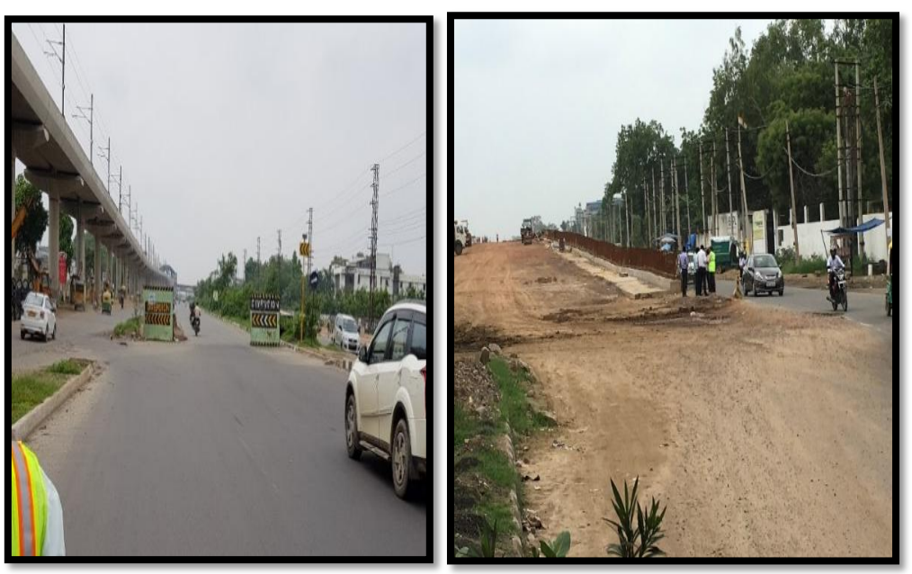
Figure 4Open Entry to construction site

The foot-over-bridge should be re-designed to relocate this pillar away from the footpath. Priority: Essential.