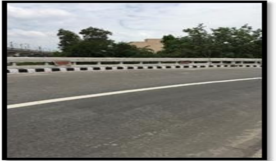
Figure 11 Chevron sign are not reflective