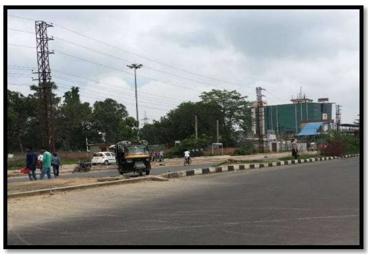
Figure 7 Vehicles climbing over the median due to damaged median.