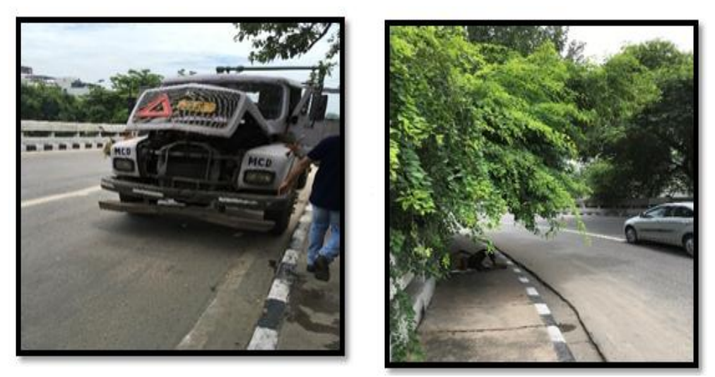
Figure 10 Heavy truck parked on the acceleration ramp&tress, bushes causing the blind spots during acceleration operation and it has a sharp curve

Proper sign board need to be provided and acceleration lane need be provided for the smooth flow Priority: Highly essential