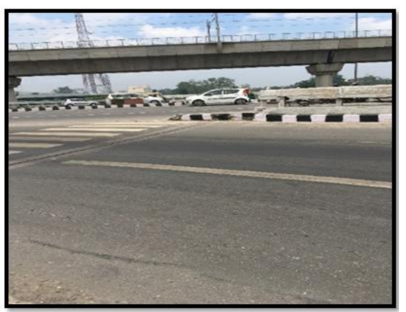
Figure 8 zebra crossing on the flyover.

Median shall be restrained/repaired and proper U turn shall be provided Priority: Essential.