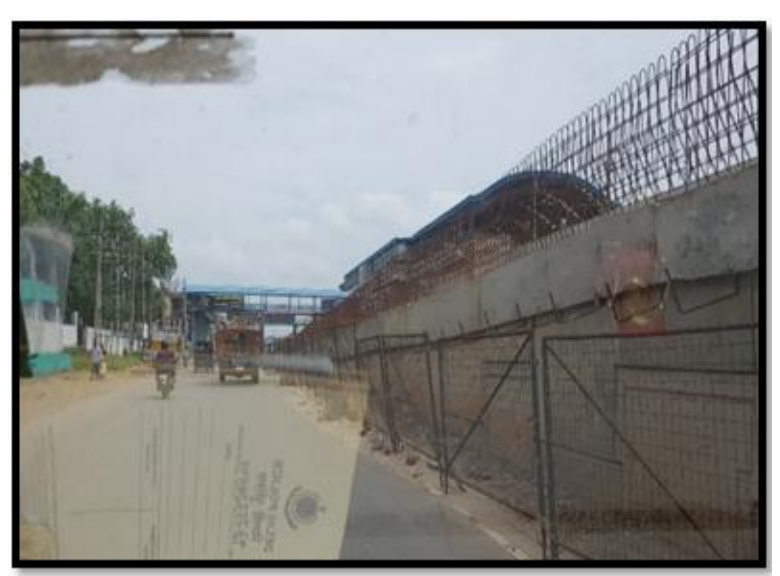
Figure 6 Barricading of working area causing hazard