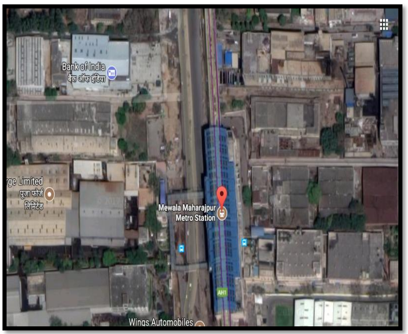
Figure 1The above image shows the Mewala Maharajpur metro station.

Construction was going on at this area. They allowed even the traffic near the construction without proper safety measures which is causing the hazard and accident-prone area. Some of the factors like whether the transitions from the existing road to the site of works safe and clearly laid out, whether the sight distance and stopping distance adequate at site of works safe and clearly laid out should be checked.