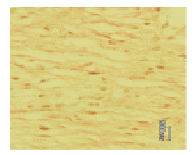
Showing the Effect of Alcoholic Extract of TO 1% Note The No. of Less Macrophages & More Collagen