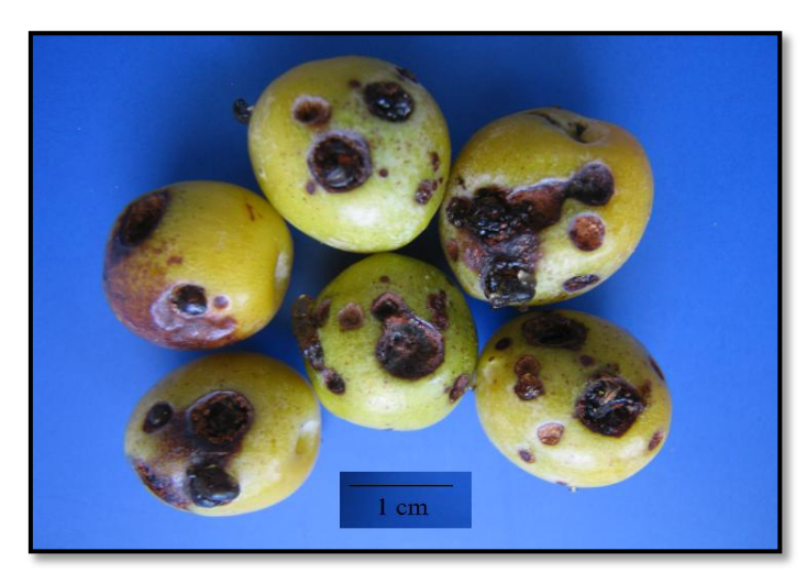
Fig. 1.Damaged wild plum fruitsby Mecorhisungarica (original)