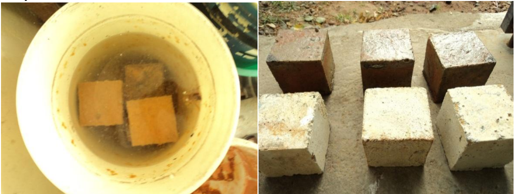
Fig.3 Cubes Exposed in Acid

Tests were carried out according to ASTM G20-8 to obtain weight loss of different type of concrete. From result of table 2, it can be observed that weight loss is more in control concrete when compare to silica fume replacement with quarry dust as fine aggregate concrete. Because silica fume have void filling ability and it have ability to resist acid attack.