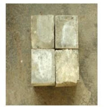
Fig.5 Cubes after alkaline attack

Tests were carried out according to ASTM G20-8 to obtain weight loss of different type of concrete. Alkaline test results are shown in Table 3. From result it will be observed that weight loss is more or less same for all type of concrete. Because when percentage replacement of silica fume increase with quarry dust as fine aggregate it will resist the alkaline attack.