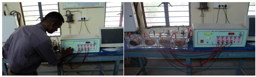
Fig.7 Rapid Chloride Set Up

The test was conducted as per ASTM–C 1202–97. Test result of RCPT for various type of concrete is shown in Table 4. From result it will be observed that conventional concrete value is slightly less than other type of concrete. Quarry dust with silica fume concrete for both 5% and 10% are more are less equal with each other. Accordingly chloride penetration of concrete decreases with an increase in a degree of compaction.