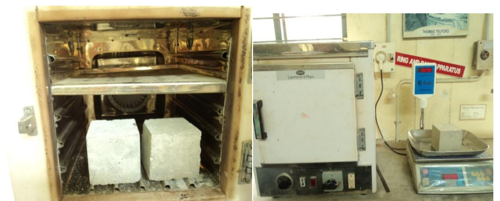
Fig.1 Placing of Cubes in Oven at 100° C

The Porosity values of different type of concrete are shown in Table 1. From result it will be observed that porosity should be less in control concrete when compare to other types of concrete, but silica fume replacement level increases porosity level get decrease. Because of the high pozzolanic nature of silica fume and its void filling ability.