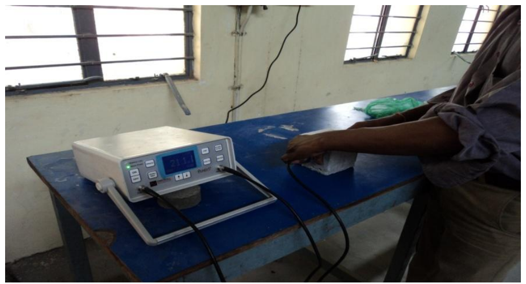
Fig.8 Ultrasonic Pulse Velocity

Ultrasonic pulse velocity testing method, which involves measurement of the time of travel of electronically generated sound wave through the concrete. From table 5 it will be obsevered that for all the concrete time of travel of an ultrasonic pulse is very good. Because all velocity values are more than 4.5 km/sec. if velocity value is more than 4.5 km/sec quality of concrete is excellent it will be suggested by Central Water and Power Research Station khadakwasla (India).