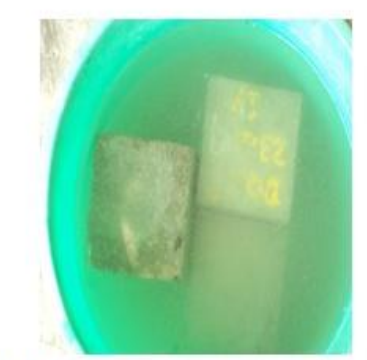
Fig.6 Cubes Exposed in Alkaline