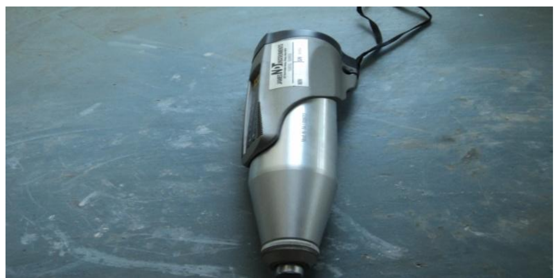
Fig.9 Rebound hammer

Rebound hammer test is used to find out hardness of concrete. From table 6 it will be observed that control concrete value is higher than quarry dust concrete. But silica fume replacement with cement concrete is nearer to control concrete value. Because when silica fume mixed with cement and quarry dust it form like a gel and make a concrete hard.