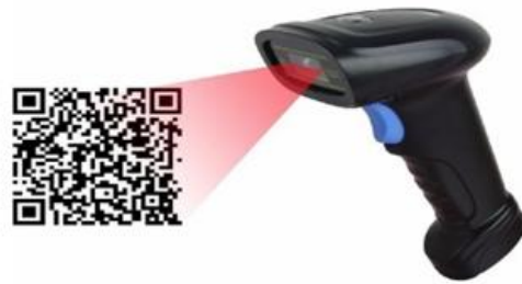
Fig 3: Barcode Reader