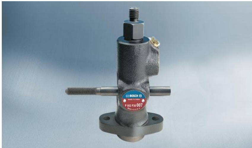
Fig 1: PF pump

The implementation of poka yoke is usually easy as the workers and management can see the immediate benefits. The only difficult part is the process of poka yoke getting started. Poka yoke can be achieved in different ways. One way is through automation. Since the pumps are assembled in indoor environment, it becomes very easy to adopt automation. Automation is for tightening the bolts especially in the steel joints. Specific torque is applied to fasteners such as nuts or bolts to shut off when preset torque is reached 2 . So that the specification is matched to a particular application and eliminating the defects. Using poka yoke mechanism the serious issues in the pump can be eliminated at the initial stages.