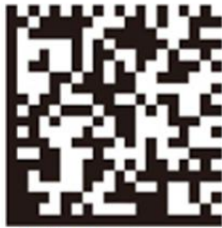
Fig 2: Data matrix code