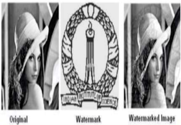
Fig. 2 Visible Watermark.

During the implementation of this system the implanted watermark is noticeable to the end point client. It is previously available strategy of watermarking. The watermark is inserted on the spread page of the picture. It is the primary technique for watermarking endeavoured with the goal of security. It is inserted so that it is unmistakably obvious by the unaided eyes to the client. In this watermark is included the spread picture. Along these lines watermark is unmistakable to the end point client plainly.