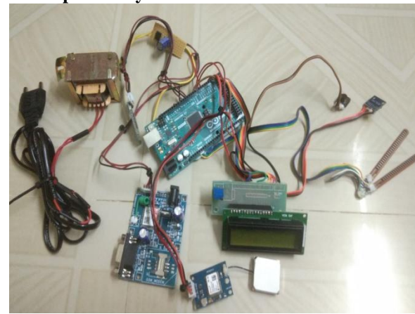
6.1 Whole System Setup